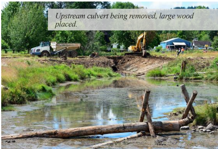
Upstream culvert being removed, large wood placed.

Nearly 50 years ago, Mitchell Creek was dammed up with two culverts to create a pond. A racetrack was built on top of the culverts. Over time the pond filled in with sediment so that the water flowing out of the pond was heated up by as much as 14 degrees Celsius (25 degrees Fahrenheit) on hot days, lethally hot for salmon. The culverts also blocked salmon migration.