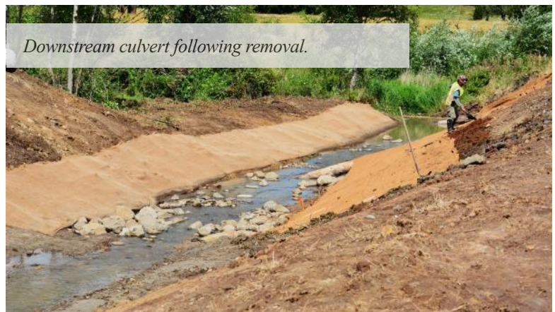
Downstream culvert following removal.

Last summer, JCWC removed both culverts--which drained the pond--and added large wood to create habitat. With volunteers and crews, we've planted more than 1,500 native shrubs and trees to help shade the newly evolving stream channel. We left a small offline seasonal wetland for amphibian, insect and bird habitat and have already started monitoring these populations as they return and change.