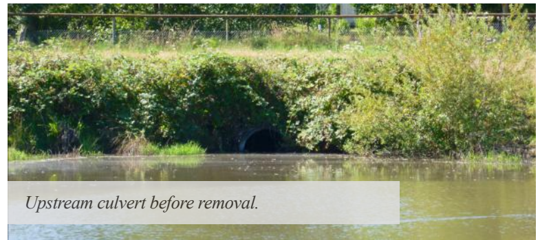
Upstream culvert before removal.

Thank you to funders Metro, East Multnomah SWCD, OWEB, PGE/TNC, ORDEQ and to project partners Wisdom of the Elders, US Fish & Wildlife Service, Oregon Dept of Fish & Wildlife.