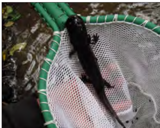
A Pacific giant salamander, found at Tryon Creek sampling location #0208, is an amphibian that is often present in Pacific Northwest streams when habitat conditions are healthy.

Tryon Creek is a seven-mile long free-flowing stream that drains a roughly 4,200-acre watershed. The stream flows in a southeasterly direction from Mt. Sylvania in the Southwest Hills of Portland to the Willamette River near Lake Oswego. It is primarily a moderate gradient stream with steep slopes, which results in a high frequency of landslides and erosion. The upper watershed has suffered impacts commonly associated with urban development, including increased stream flow velocities and volumes following storm events, with subsequent stream bank erosion.