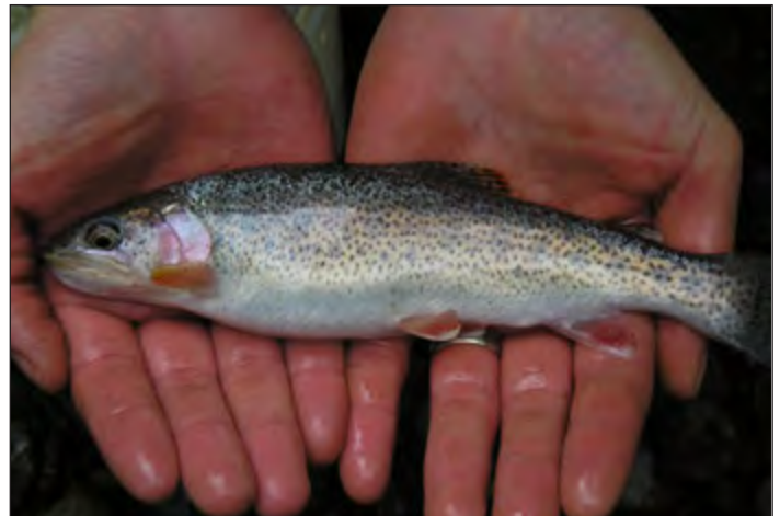
Cutthroat trout are one of five most commonly encountered species in Portland watersheds.