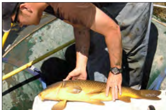
Field staff measuring a common carp, a non-native fish species common in the Columbia Slough. Non-native fish are abundant in the Columbia Slough. While most Portland streams typically have less than 1% non-native fish comprising their fish communities, the Columbia Slough has well over 20% non-native fish in its fish communities.

The Columbia Slough begins at Fairview Lake and meanders west for 19 miles to Kelley Point Park where it empties into the Willamette River. Historically, the Columbia Slough waterway was a low-gradient collection of wetlands, lakes and streams that formed the Columbia and Willamette River floodplains. The slough is Portland’s most altered watershed and waterway. Over the years, the area was heavily altered to accommodate industry, transportation and agriculture. Beginning in 1918, levees were built to provide flood protection. Wetlands and side channels were drained and filled to allow for development. The waterway was channelized, and dozens of streams were filled or diverted to underground pipes.