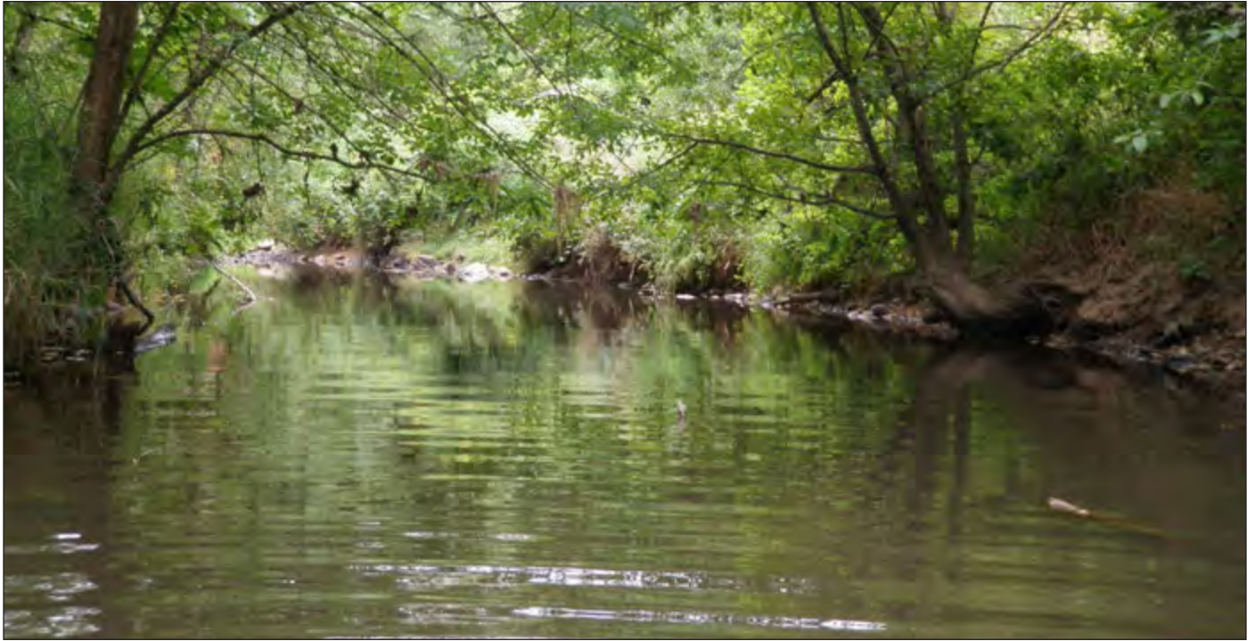
Sampling site #0124 is in middle Johnson Creek and shows trees in the riparian area along the banks. The riparian vegetation shades streams and moderates stream temperatures, controls erosion, and provides a source of organic matter and insects that support aquatic food chains.