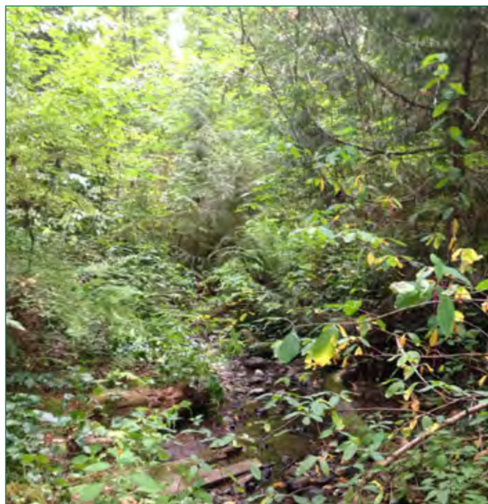
Riparian vegetation at sampling location #0234