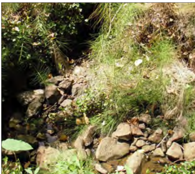
Stephens Creek sampling location #0012 shows a range of sizes in stream substrate. Substrate – the gravel, cobbles, sand and organic matter that form the stream bottom – are very important to stream health.

The Willamette Streams are a diverse set of streams that range from the highly impacted and urbanized Stephens Creek to the well-vegetated and protected streams within Forest Park. These small watersheds all drain the West Hills before discharging to the Willamette River mainstem. They are therefore grouped together into a “watershed” called the Willamette Streams, a sub-area of Portland’s Willamette River Watershed. Because of their diverse land uses and characteristics, these streams typically had wide ranges in watershed metrics.