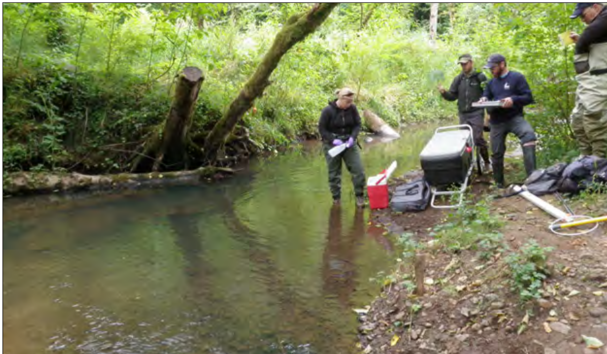
Tryon Creek sampling location #0208, at the restoration project near 4th Ave. The creek had eroded its banks and exposed a sewer pipe. The restoration project protected and stabilized the sewer pipe, and enhanced aquatic habitat by redirecting the creek away from the pipe, adding large wood, creating pool and riffle habitats, and revegetating riparian and floodplain areas.