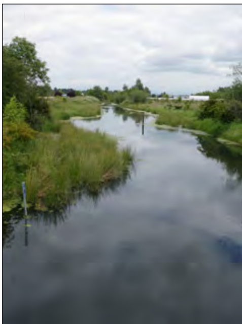
This Columbia Slough site (0129) is an example of a typical slough site. The slough is a naturally low-gradient, slow-flowing system which is very different from the other streams in Portland.

The Columbia Slough begins at Fairview Lake and meanders west for 19 miles to Kelley Point Park where it empties into the Willamette River. Historically, the Columbia Slough waterway was a low-gradient collection of wetlands, lakes and streams that formed the Columbia and Willamette River floodplains. The slough is Portland’s most altered watershed and waterway. Over the years, the area was heavily altered to accommodate industry, transportation and agriculture. Beginning in 1918, levees were built to provide flood protection. Wetlands and side channels were drained and filled to allow for development. The waterway was channelized, and dozens of streams were filled or diverted to underground pipes.