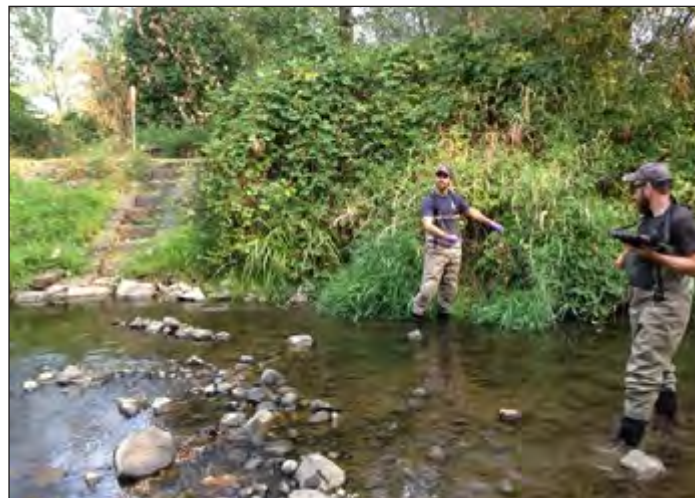
Crews sample at location #0352 in the lower mainstem of Johnson Creek.

Johnson Creek originates in the hills east of Portland and flows westward approximately 25 miles to its confluence with the Willamette River. The stream receives water from several major tributaries, including Crystal Springs Creek, Kelley Creek, Mitchell Creek, Butler Creek, Hogan Creek, Sunshine Creek and Badger Creek. Land use in the 34,310-acre watershed ranges from heavily developed urban and industrial areas to rural farm and nursery lands.