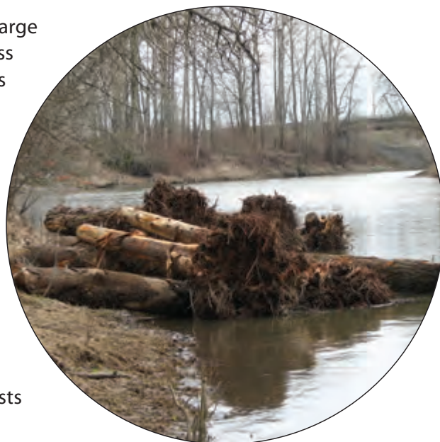
Inadequate volumes of large wood is a widespread problem across Portland's watersheds.