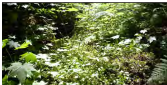
Saltzman Creek at sampling site #0137 shows mature vegetation present at many Forest Park streams.

The Willamette Streams are a diverse set of streams that range from the highly impacted and urbanized Stephens Creek to the well-vegetated and protected streams within Forest Park. These small watersheds all drain the West Hills before discharging to the Willamette River mainstem. They are therefore grouped together into a “watershed” called the Willamette Streams, a sub-area of Portland’s Willamette River Watershed. Because of their diverse land uses and characteristics, these streams typically had wide ranges in watershed metrics.