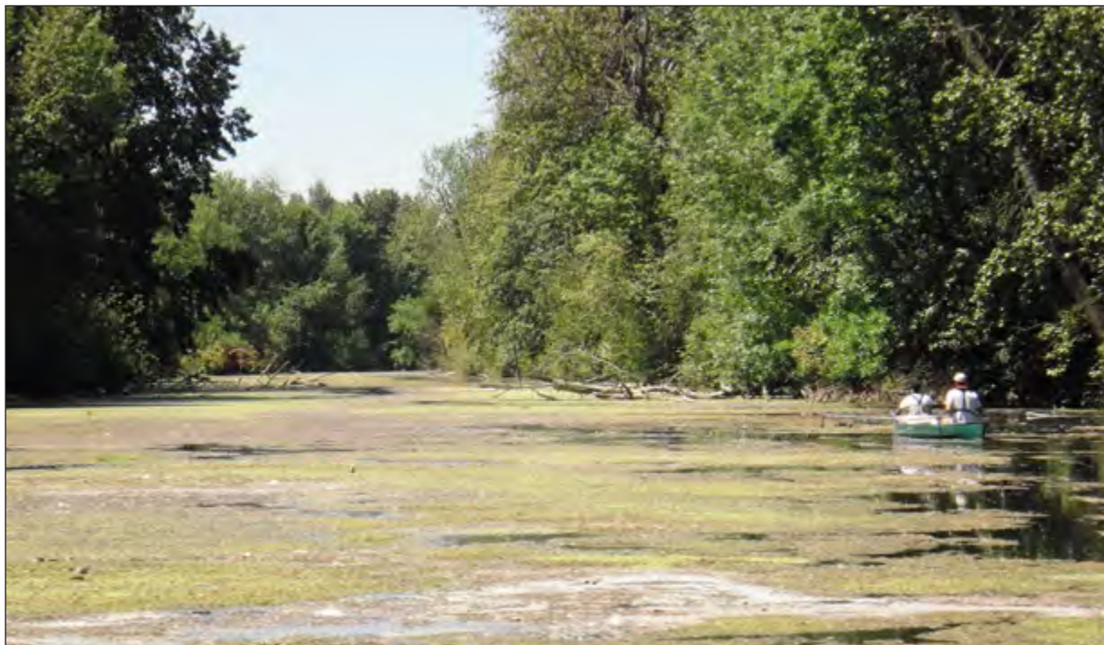
The Columbia Slough at Whitaker Slough (site 0273) is an example of a “boatable” survey site, where deep water does not allow field staff to traverse the stream safely on foot and sampling must be done from a boat.