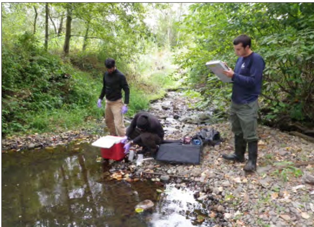
Field crew gather information at sampling site #0524. Information on instream habitat and riparian conditions helps identify the major factors threatening stream health.