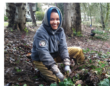
NCCC AmeriCorps removed 3,300 lbs. of invasive weeds.