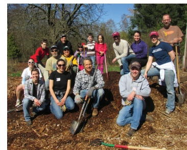
Together, we planted 26,000 native trees and shrubs.