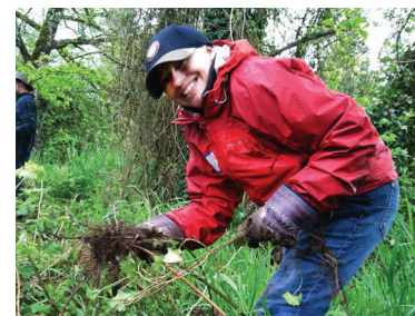
1,300 volunteers helped restore Johnson Creek in 2013.