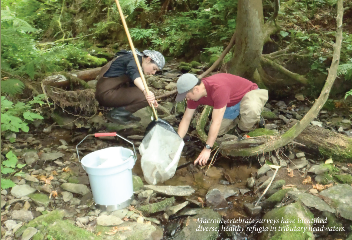
Macroinvertebrate surveys have identified diverse, healthy refugia in tributary headwaters.