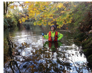
Five coho were found by volunteer surveyors in upper Johnson Creek.