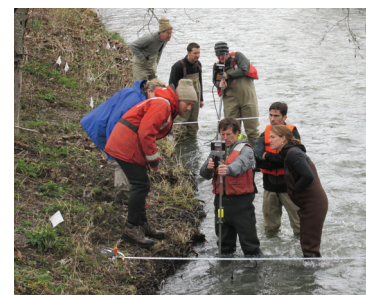
Winter USGS streamflow measurement training.