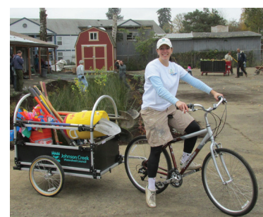
Planting day at the St. Mary Ethiopian Orthodox Church.