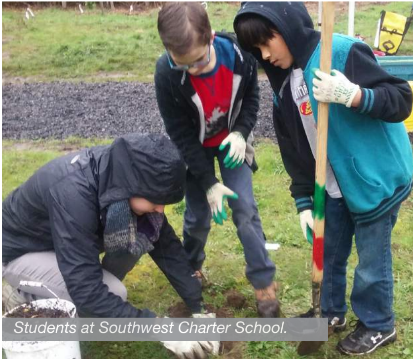
Students at Southwest Charter School.