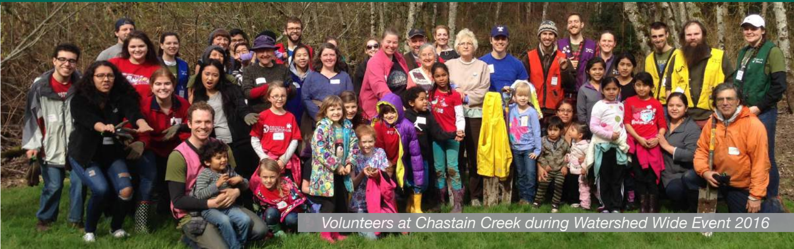
Volunteers at Chastain Creek during Watershed Wide Event 2016

For the second year in a row, we've set a new record for the number of volunteer sign-ups: 1,955! By contributing more than 8,000 hours of their time, local residents have made a powerful statement about our mainly-urban stream. We are successful because of our volunteers.