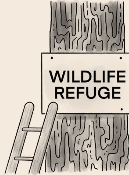
Fighting for Oaks Bottom Wildlife Refuge