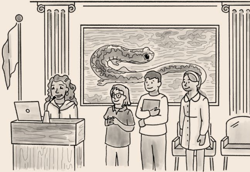
Hogan Cedars Students & Gresham's Official Amphibian